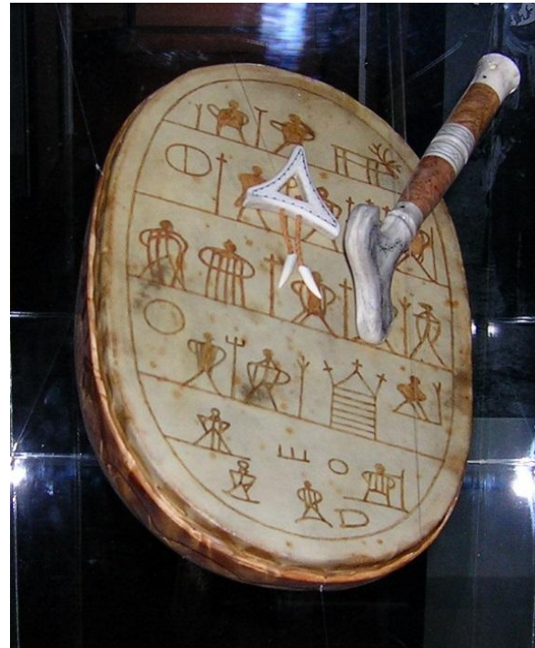
Su goavddis- his Drum